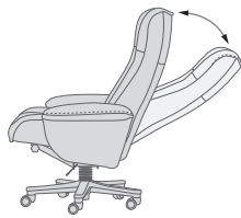
EFFORTLESS RECLINING MECHANISM