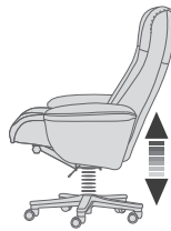
GAS LIFT SEAT HEIGHT ADJUSTMENT