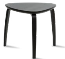
Triangle Table Wood: 920 Black