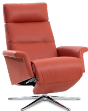
Space Power 3600 Leather: Trend 422 Brick Base: Classic Polished