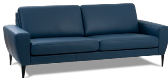
Nordal 3s Duo