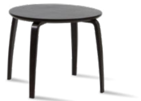
Round Table Wood: 911 Espresso