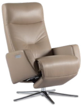
Space Power 2100 Leather: Trend 414 Pebble Base: Classic Polished