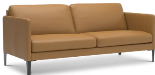
Namsos 3s Duo