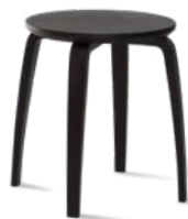
Side Table Wood: 911 Espresso