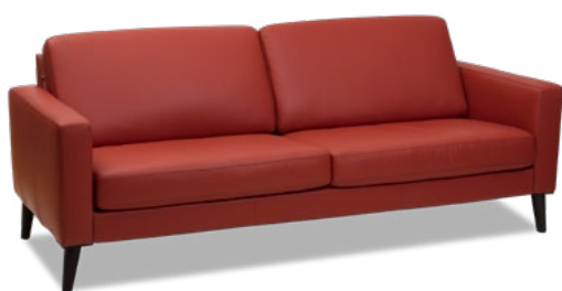
Narvik 3s Duo