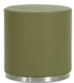
Cylinder Ottoman Leather: Trend 418 Leaf