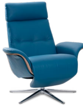
Space Power 5100 Leather: Prime 327 Sky Wood: 901 Oak Base: Classic Polished