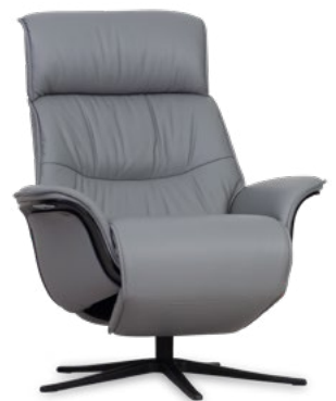
Space Power 5300 Leather: Trend 423 Storm Wood: 920 Black Base: Classic Black